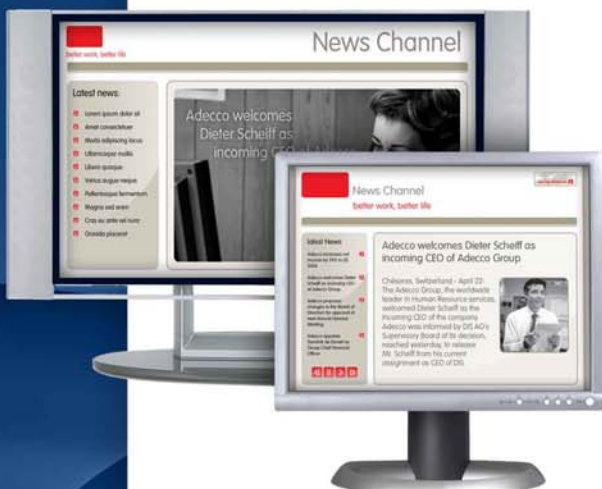
Digital Signage on PCs and big screens

info@netpresenter.com www.netpresenter.com